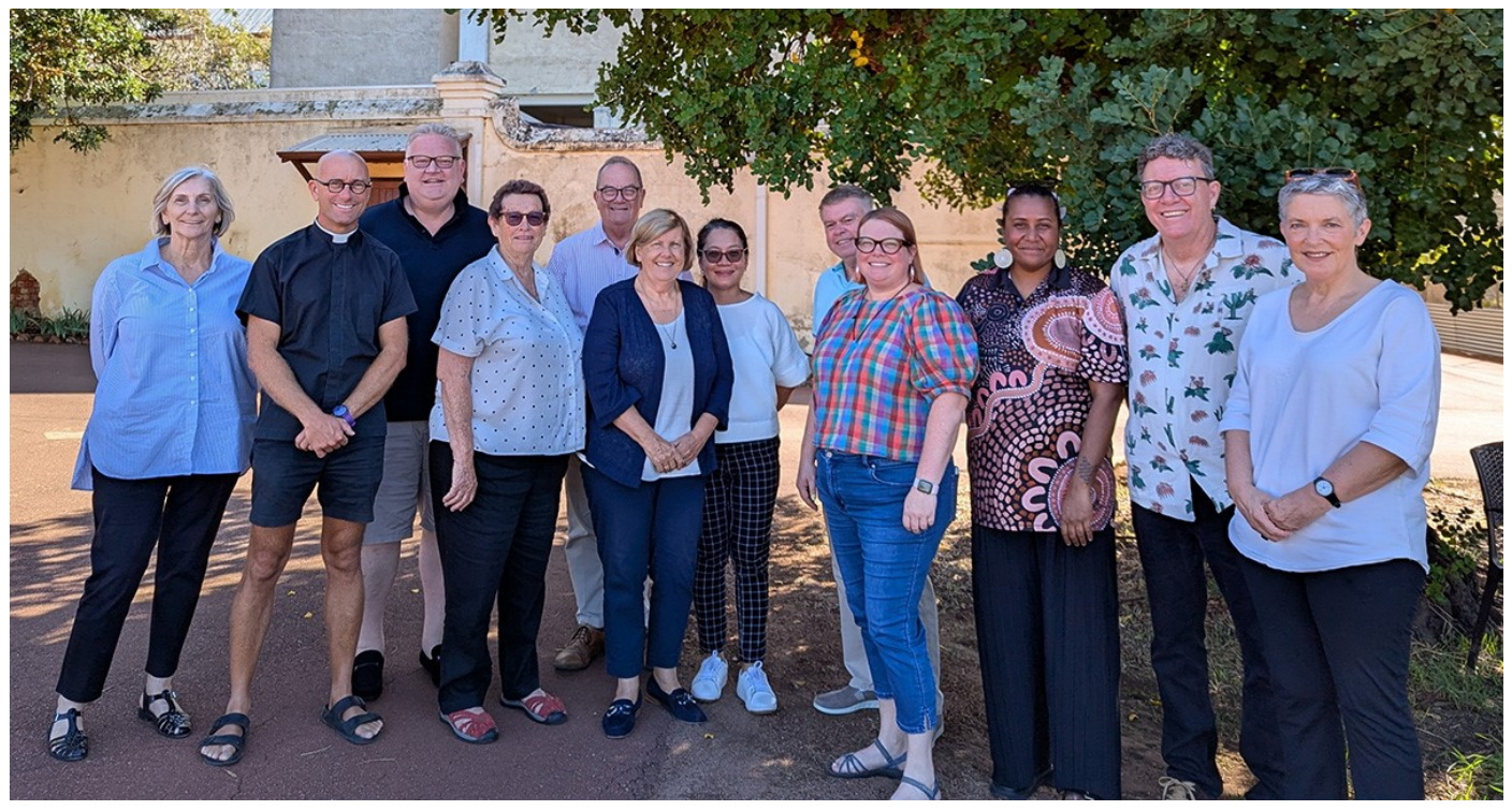
The thinkers and dreamers meeting at the New Norcia Monastery

From 19 to 21 March a group of thinkers and dreamers met at the monastery town of New Norcia to reimagine ABM for the next 25 years – or more. This was part of an ongoing process, as we took time to prayerfully reflect on where we have been – and where God is calling us, as a church and as ABM/AID.