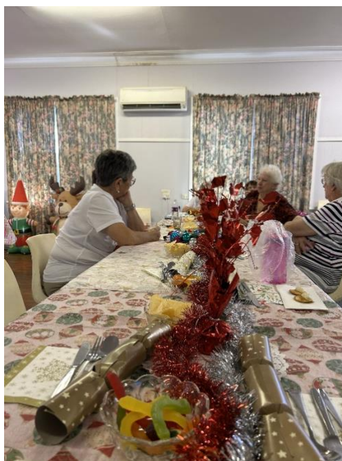
Elders Christmas party in Dubbo