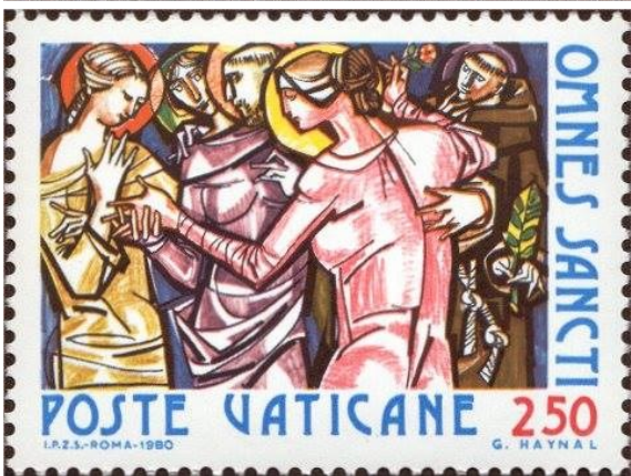
A pair of Vatican City postage stamps that commemorate All Saints' Day, which is celebrated on 1 November.