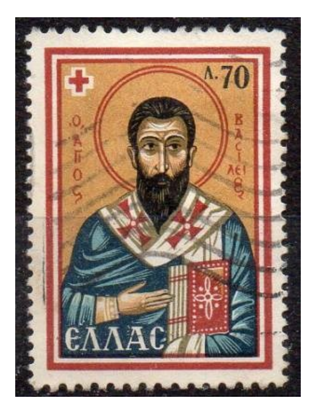
A Greek postage stamp featuring St Basil the Great, whose Feast Day is on Monday 2 January. For more information, see en.wikipedia.org/wiki/ Basil_of_Caesarea