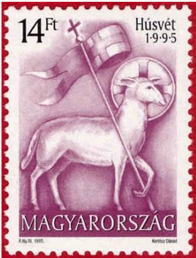
An Easter postage stamp from Hungary featuring the victorious Lamb that was slain.