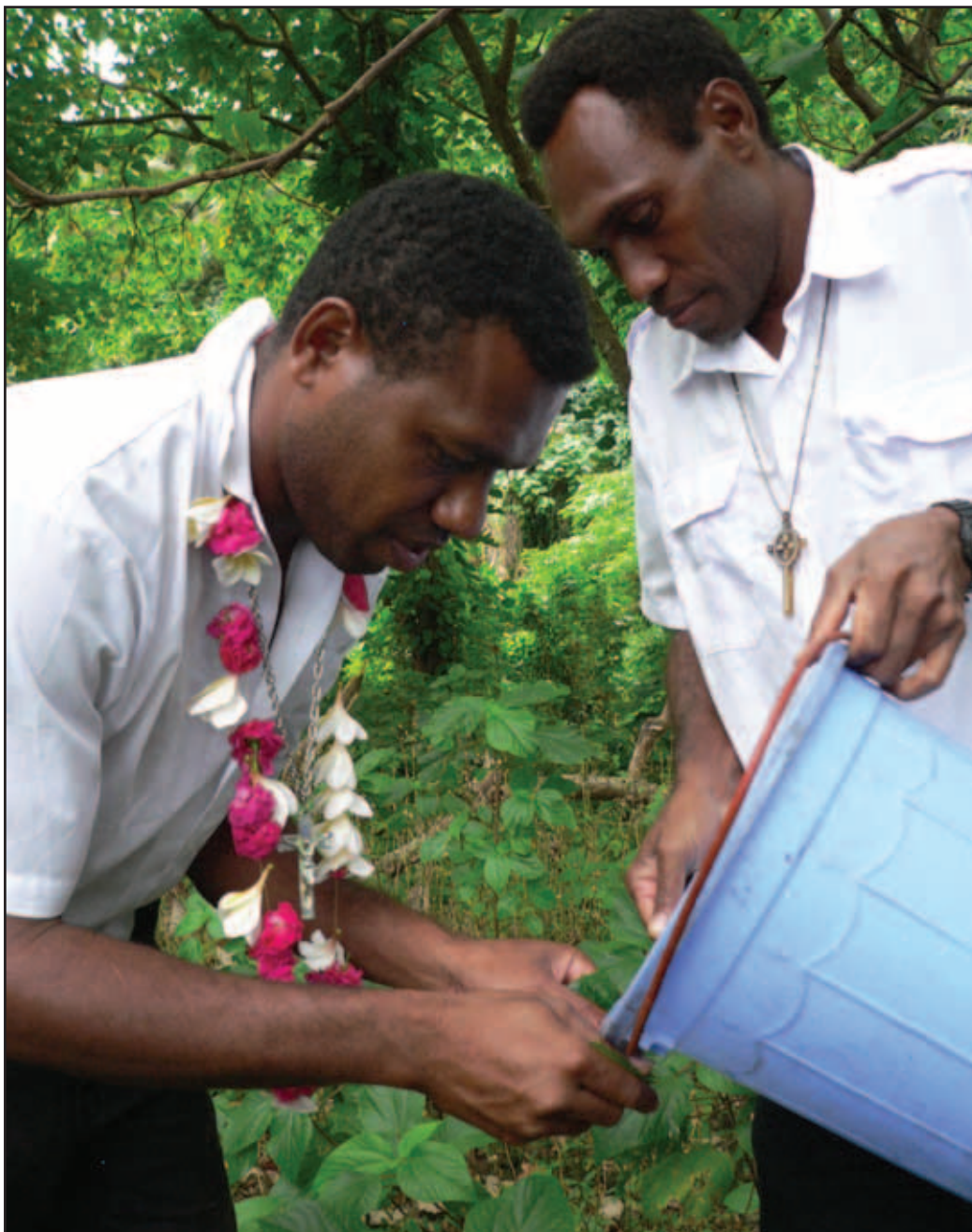
Regularly testing the water for purity in and around the communities in Vanuatu needs to be done diligently. With the assistance of the ABM Auxiliary scenes like this may thankfully soon become a thing of the past.