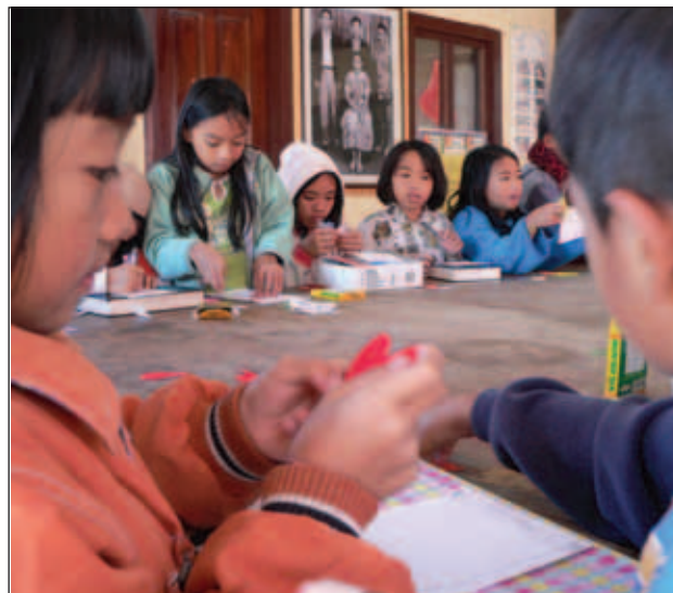
Here at this Sunday School in Baguio, Love is practiced as much as it is preached.

Still very young as an autonomous province, the Episcopal Church in the Philippines is a poor church filled with highly motivated leaders brimming with new ideas. Because of the growth of the church, rural and remote parishes in some dioceses are led by semi-trained priests or willing lay people. Many of these people have a strong desire to undertake or complete their theological education if only the funds can be found. Other dioceses, like Santiago, have a strong need to bring their parish leaders together for joint study and growth. With your help the church in the Philippines is being strengthened to reach out and make a greater impact in the communities it serves.