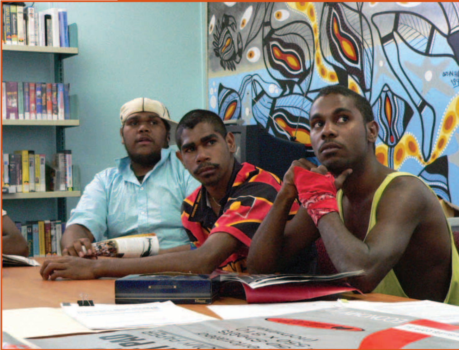
At Yarrabah community near Cairns, a ministry amongst young people is making a significant difference in the lives of many through the building up of leaders and the offering of activities such as cultural dance, art and drama.

A BM's priorities in supporting Indigenous Australian Anglicans – both Aboriginal and Torres Strait Islanders – are to support the ministry of Indigenous Australians with their own people and communities and to support programs of training and leadership development. The people and projects contribute to the development of Indigenous communities and the Australian community as a whole. The overall program has an emphasis on local leadership development rather than external leadership.