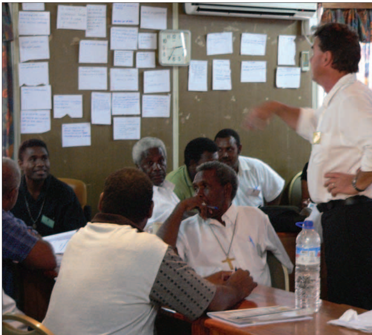
The Church of Melanesia meets together regularly to consult and review the programs to be offered by the church to local communities throughout the province – which includes the Solomon Islands and Vanuatu.