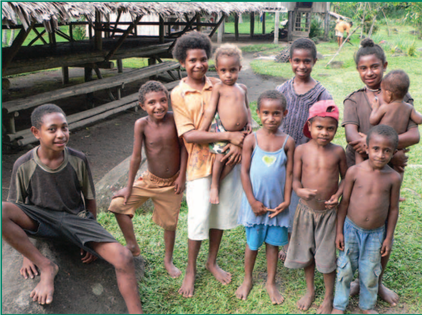
Assistance provided by Australians for the children of Clergy and Catechists in PNG to attend school is giving hope for the future.