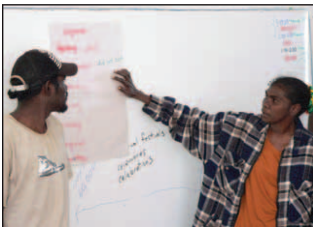
In the context of learning, discussions about culture and place take on special meaning for those studying at Nungalinya and Wontulp-Bi-Buya College.