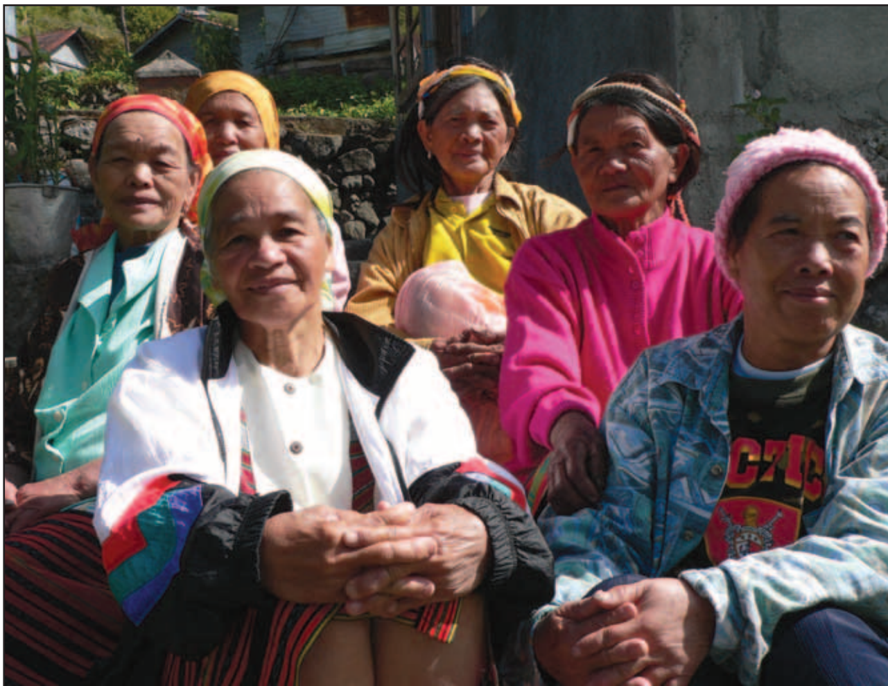
Faces worn hard by long hours of manual work and life itself. These women can now look to a different future for their own children and grandchildren with the provision in their communities of fresh clean water, post-harvest facilities and opportunities for income generation.

One community situated 14kms from the nearest town hires a 'weapons carrier' (the only type of local vehicle that can reach the community) straight after harvest so that corn can be dried on one side of the highway in the town and then transported again to another town where the corn buyers are located.