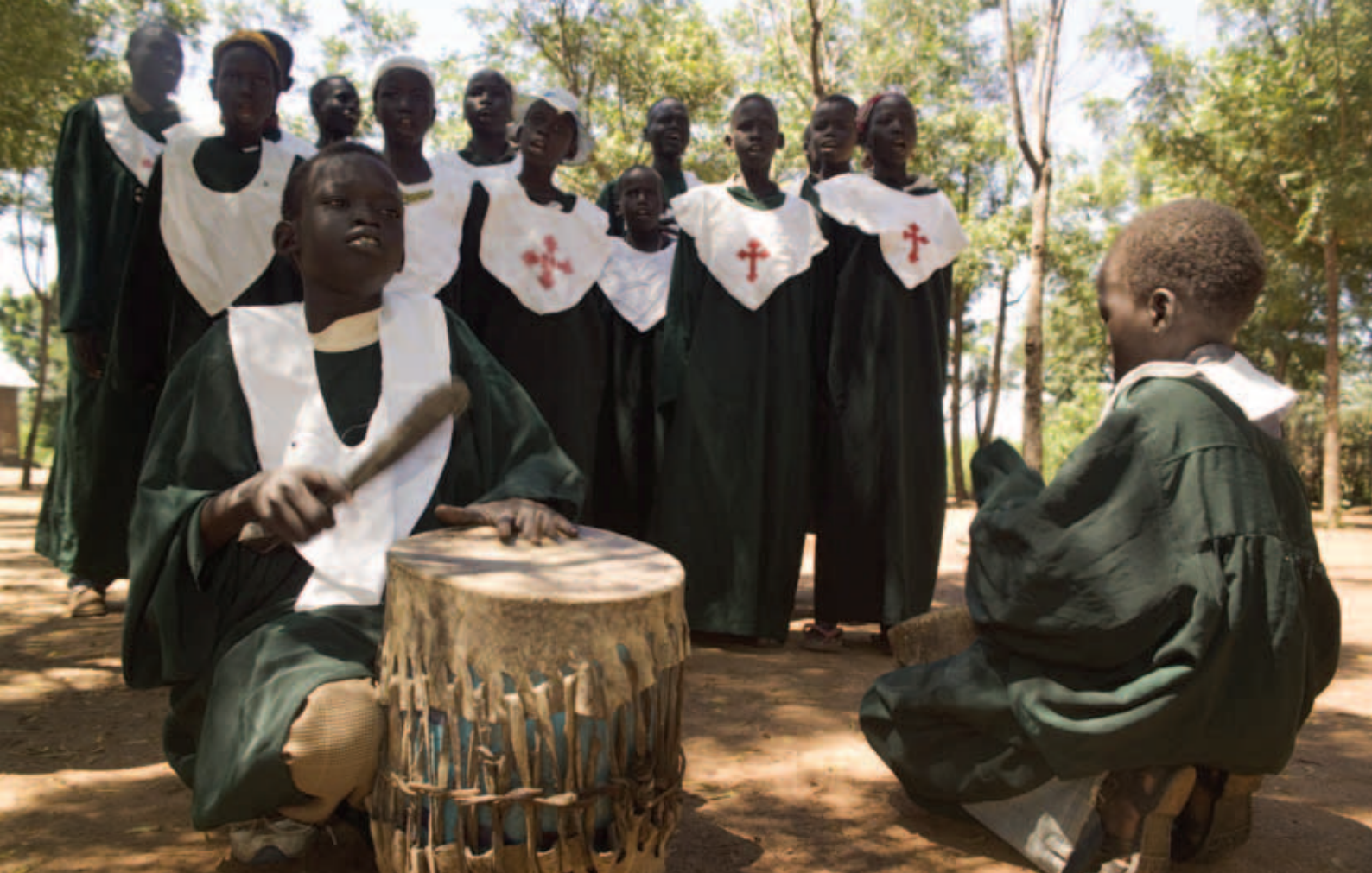
The choir of St Luke's Church, Gambella, on the border of Ethiopia and Sudan.

We have always supported a project; do we have to fill in a form?