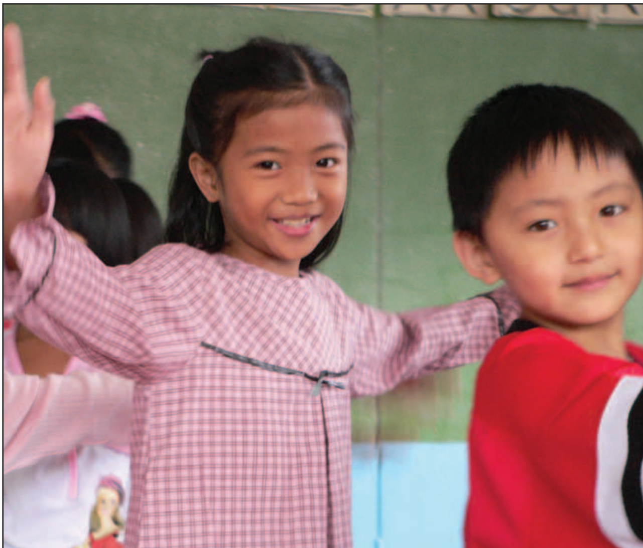
Flying high. With a new curriculum and trained teachers, Sunday School has never before been so much fun.