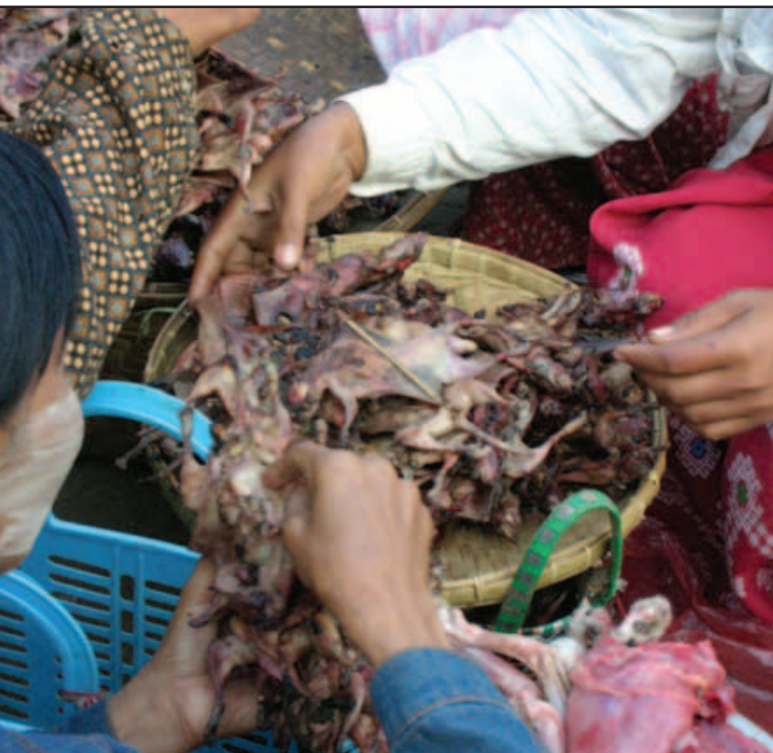
Training in small business ventures such as fishing, ensures communities can have a livelihood for the future.