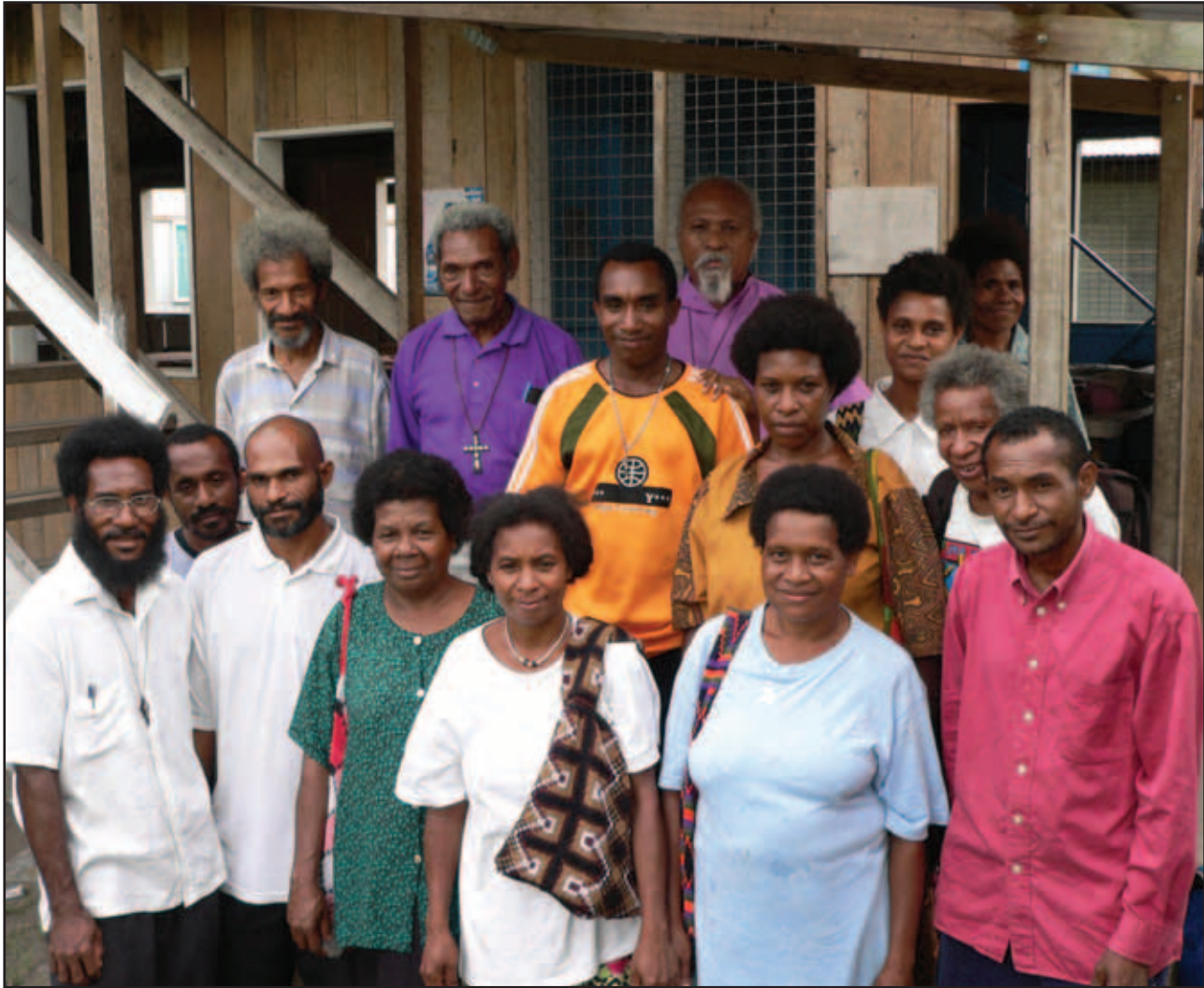
Instruction and encouragement. These recently ordained Deacons and Priests were able to travel from the far corners of Popondota Diocese to undergo in-service training with their Bishop and senior clergy.