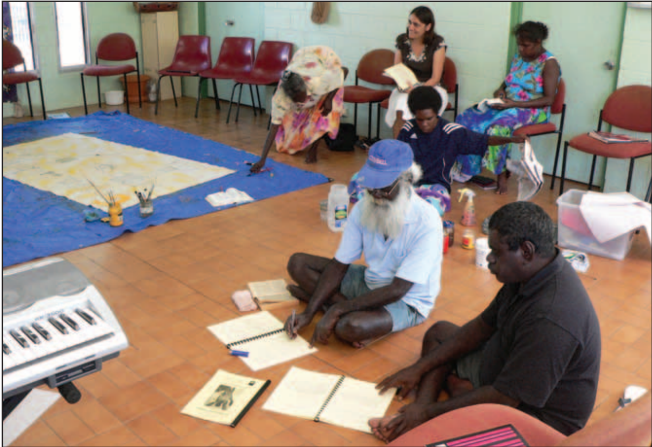
Preparing for chapel at Nungalinya College, Darwin.