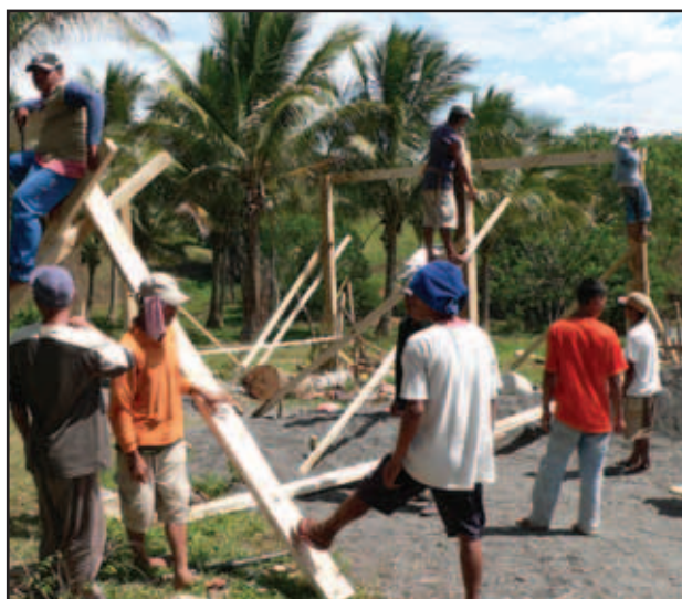
This grain store being built in Kinitaan Community in the Southern Philippines will mean that farmers no longer have to seek expensive rental facilities outside the community to store their grain. It will also reduce the amount of grain subject to spoilage and waste as a result of being left outside.

*Donations to this project are tax deductible for individuals.