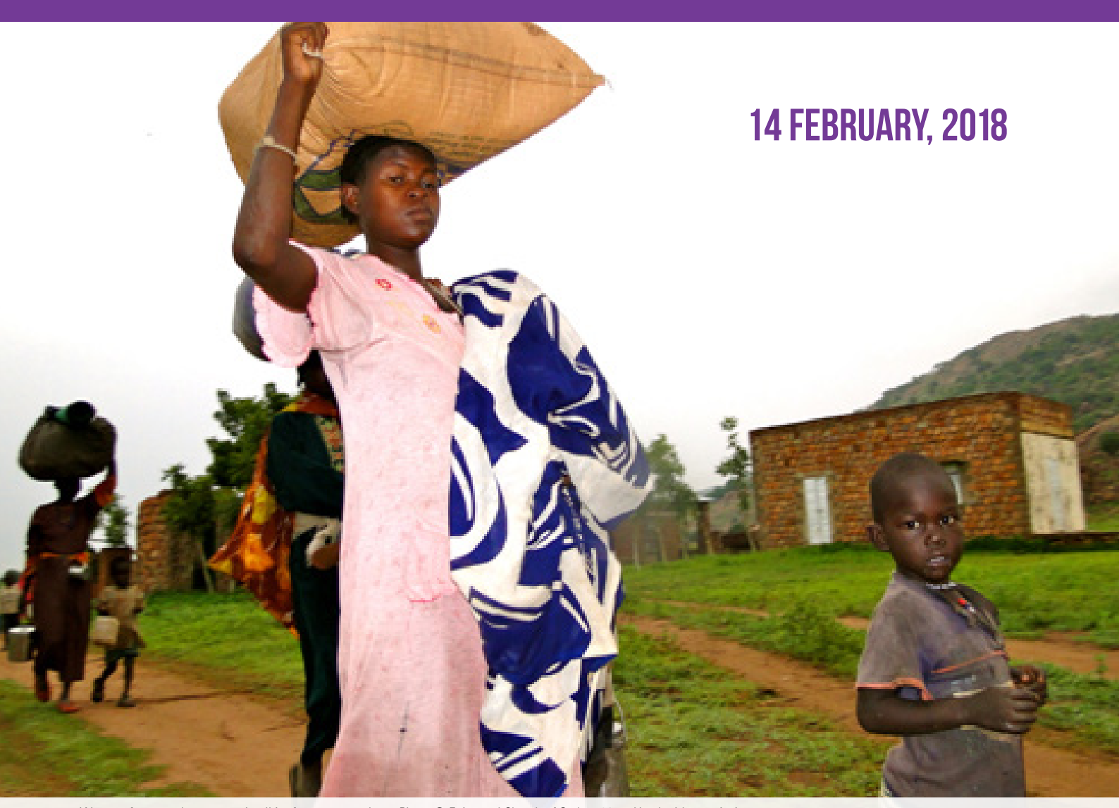
We pray for an end to poverty in all its forms, everywhere.