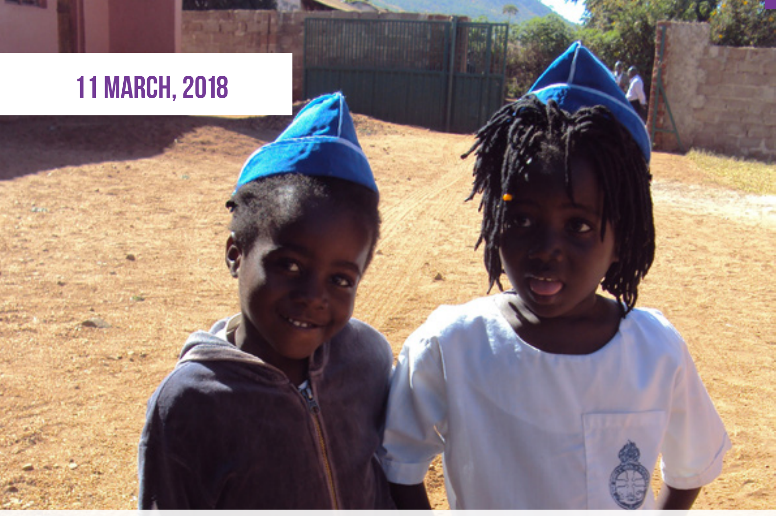
Let us pray that these girls will grow up knowing equality and empowerment.