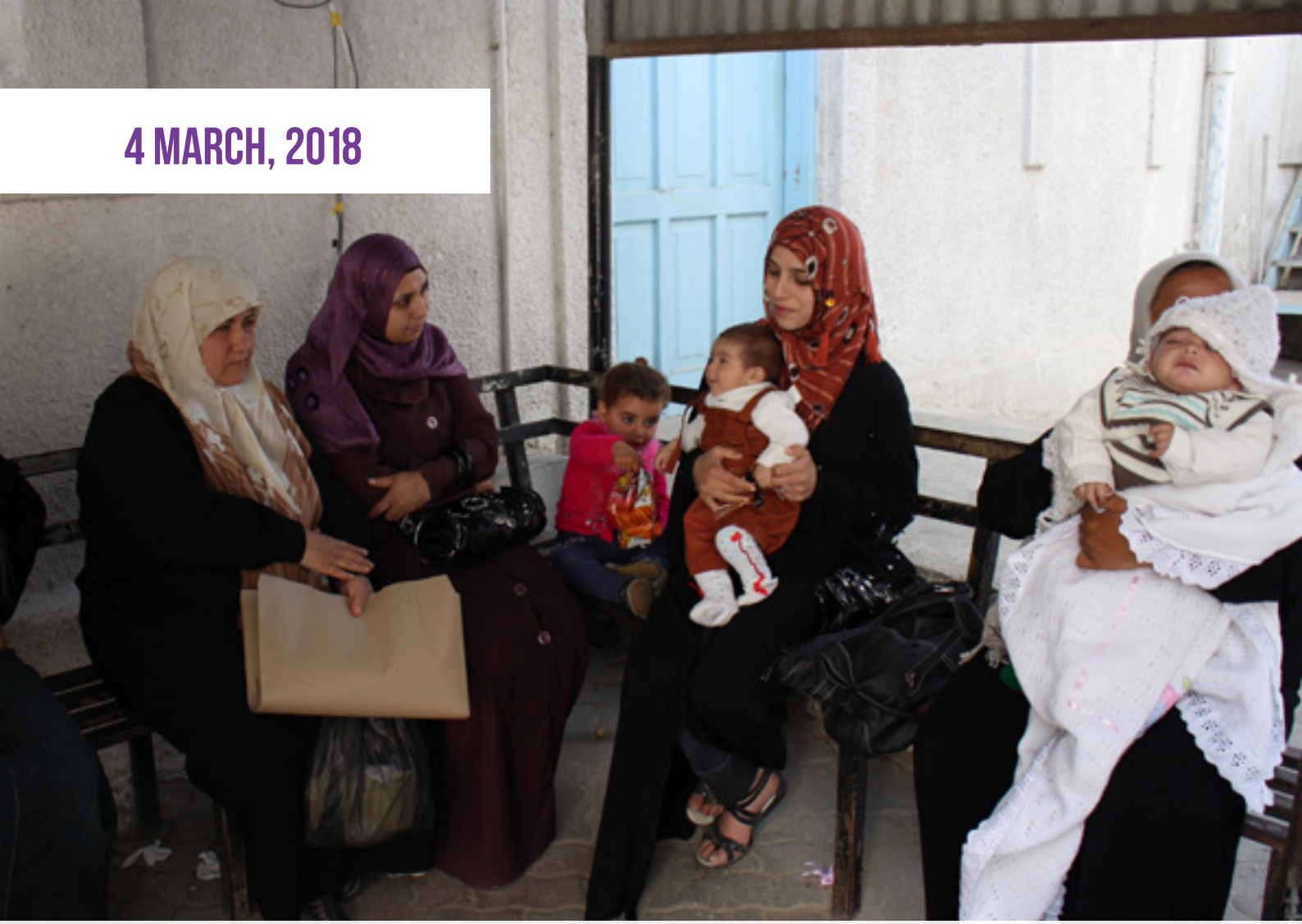
Let us pray for the work of the Al Ahli Arab Hospital in Gaza, and give thanks for all that they are doing to achieve well-being for all at every age.