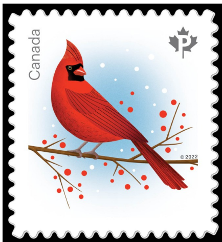
Postage stamp from Canada that features a cardinal

Your used and mint postage stamps are valuable to ABM because we can use them to help fund mission.