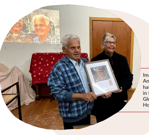
Image: Melanesian Brothers in the Torres Strait © Diocese of North Queensland.

Image: Holy Trinity Anglican Church in Dubbo has named the main room in their church hall in Gloria Shipp's honour © Holy Trinity Church.