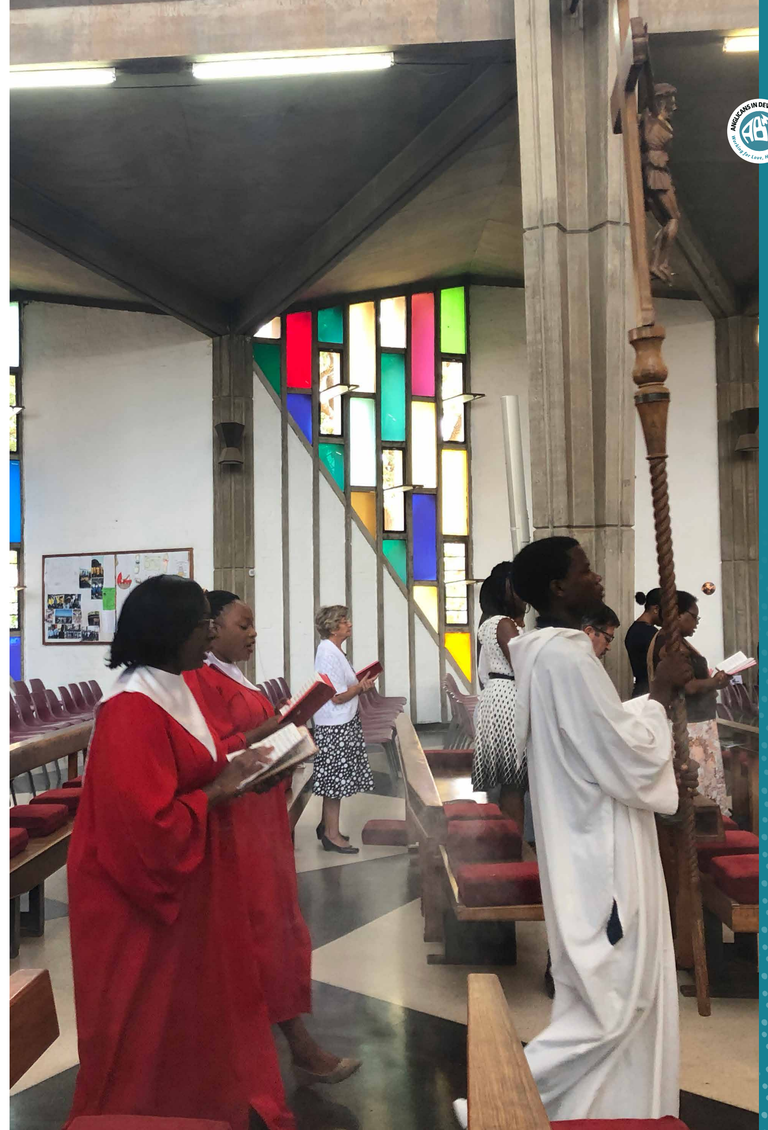
Choir entering the church, Lusaka