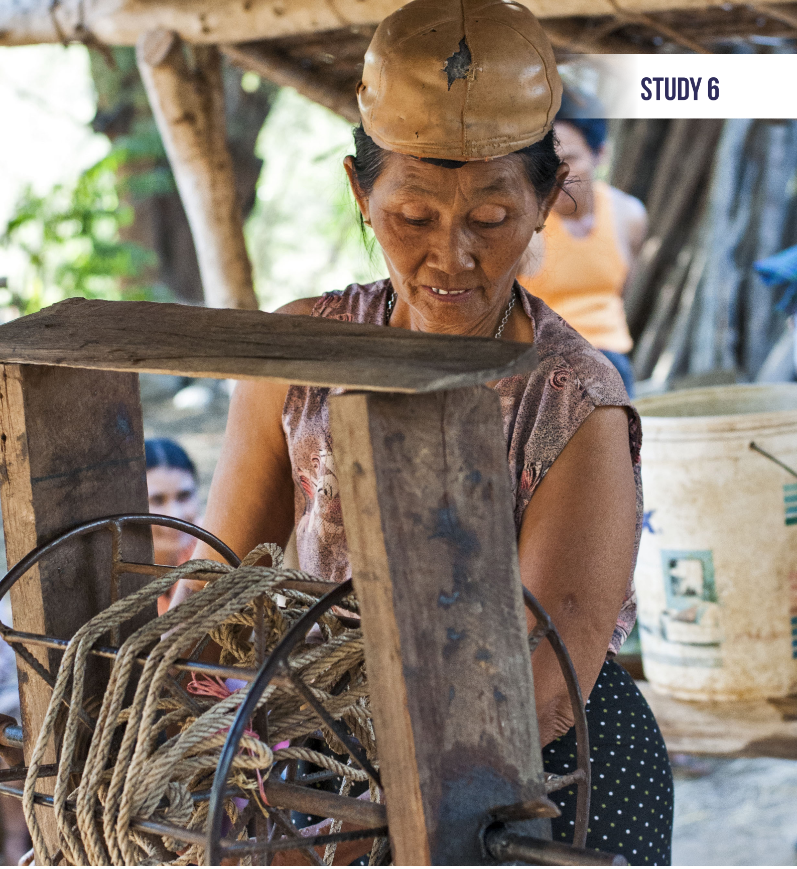
As we ponder the strength of this woman fetching water from the well, let us give thanks for water projects like this one in Myi Ni Gone Village, Myanmar, that help achieve healthy lives and promote well-being for all.