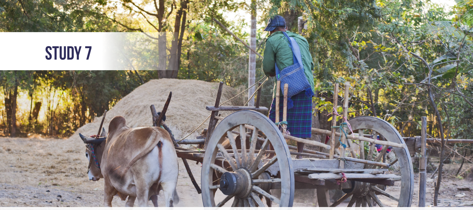
A man going home at sunset in Kyo Kyar Village, Myanmar. "The Church of the Province of Myanmar works in partnership with local villages, with ABM, and others, to help bring about those aspects of the SDGs that are most needed in the local context."