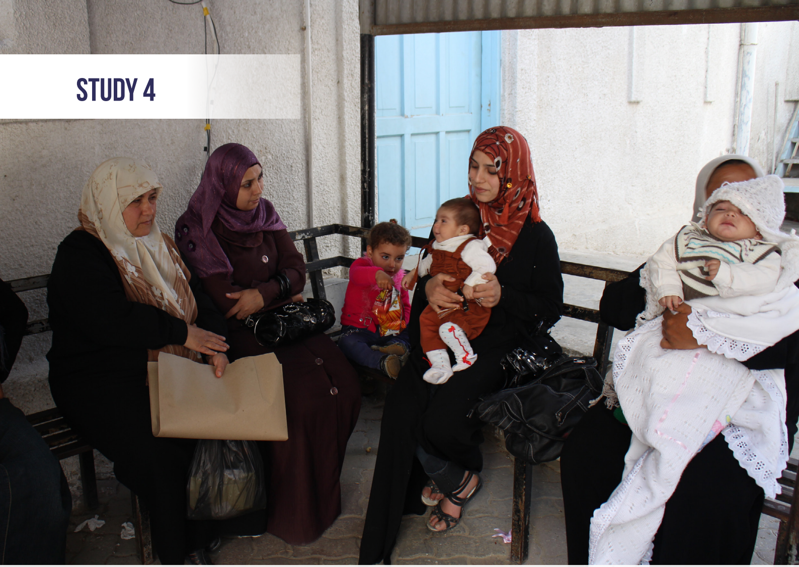
Let us pray for the work of the Al Ahli Arab Hospital in Gaza, and give thanks for all that they are doing to achieve well-being for all at every age.