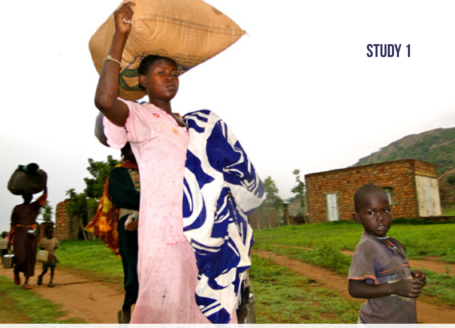
We pray for an end to poverty in all its forms, everywhere. Photo © Episcopal Church of Sudan, 2011. Used with permission.