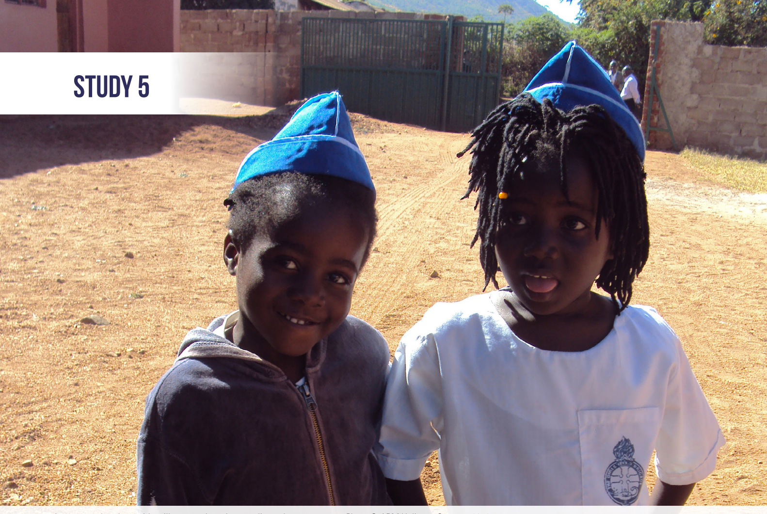
Let us pray that these girls will grow up knowing equality and empowerment.